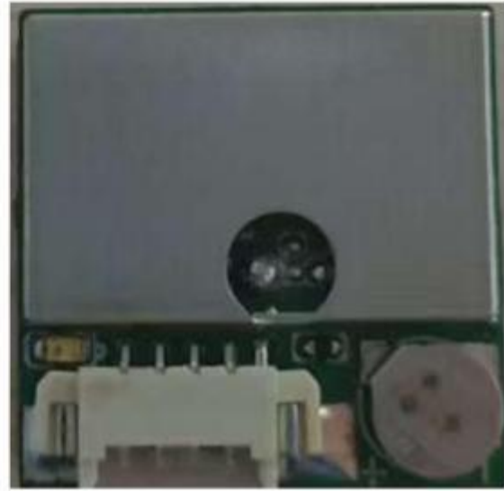
GND RX TX 5V 1PPS